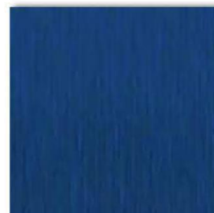
METAL-3 MANUFACTURER: ATAS / I-PIECE COLOR: BRILLIANT BLUE FINISH: STERRA CORE (MCM) PRE-FINISH