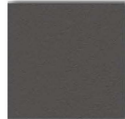
EIFS-5 MANUFACTURER: STO CORP / 310D STO STOLIK COLOR: DARK + GLOSSY 37100