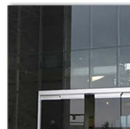
CURTAIN WALL MANUFACTURER: KAWNEER 1600 WALL SYSTEM COLOR: TEMPERED CLEAR GLASS FINISH: GREY TINTED