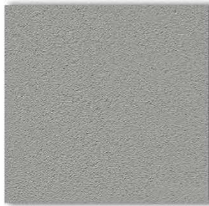
EIFS-1 MANUFACTURER: STO CORP / STO ESSENCE COLOR: NA17-0050 FINISH: FINE SAND COLOR TO MATCH SW 9162 - AFRICAN GREY