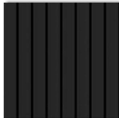
ALUMINUM PANELING MANUFACTURER: KNOTWOOD COLOR: KE150 FINISH: TEXTURA BLACK