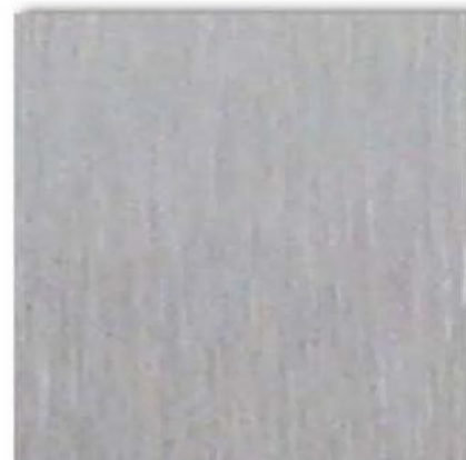
METAL-1 MANUFACTURER: PAC CLAD / ALUMINUM COPING COLOR: SILVER FINISH: PRE-FINISH